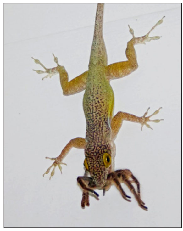
FIGURE 1 . An adult male Leach's Anole ( Anolis leachii ) forages on a tarantula ( Cyrtopholis sp.) under an artificial light source on Long Island, Antigua, in summer 2016.

Our surveys starting roughly one hour after sunset revealed activity patterns for A. leachii and A. wattsi that were both right-shifted (relative to midnight as the center of the x-axis; Fig. 2). The detections for A. wattsi , however, were densely distributed around 0500 resulting in a pronounced unimodal peak, whereas A. leachii detections were more evenly distributed through the night (Fig. 2). There was no significant difference between individual nocturnal activity patterns for A. leachii (mean PSi = 0.41 \pm [SD] 0.30 , P = 0.732; Fig. 3). SVL measurements from four A. leachii individuals indicated a mean body size of 9.5 \pm (SE) 0.13 cm; all of the individuals detected were of similar size.