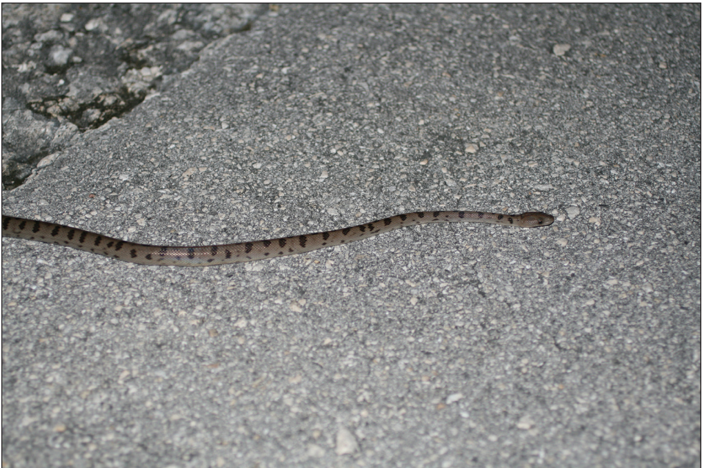
Figure 3. Live young male Chilabothrus exsul crossing the road leading to Little Harbour, Abaco.

We surveyed a total of 700.4 km over the course of 17 sampling sessions on Transect 1. We found 7 boas during the surveys. We spotted 3 live animals as they were entering the roadway: 1 adult female (Fig. 2), 1 young adult male (Fig. 3), and 1 juvenile (young-of-year) undergoing ontogenetic color change (Fig. 2). We measured, photographed, genetically sampled, and subsequently released these individuals well off of the road. We found 4 dead boas consisting of 3 adult females