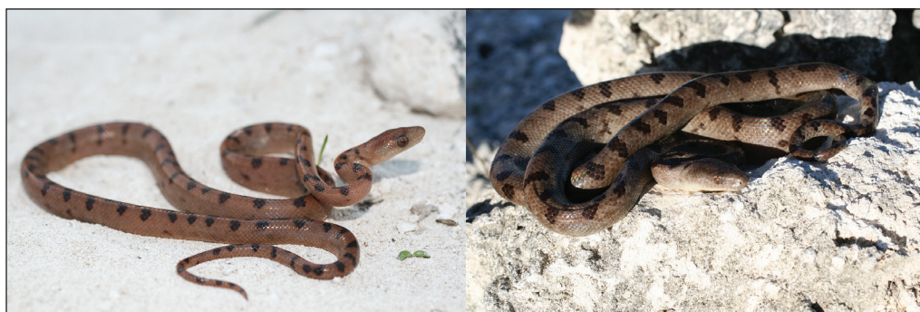
Figure 2. Live Chilabothrus exsul found during nocturnal road surveys. On the left is a young-of-year female still exhibiting juvenile orange coloration. On the right is an adult female.

Our Transect 1 consisted of a 41.2-km loop, which included a 16-km back-track, on both blacktop (39.1 km) and unfinished road surfaces (3.7 km). We selected this transect to maximize both distance covered and sampling of a variety of habitat types, including mature Caribbean Pine forest, agricultural land, mature and regenerating coppice, and mangrove ( Rhizophora mangle L. [Red Mangrove] and Avicennia germinans (L.) L. [Black Mangrove]) forest. For