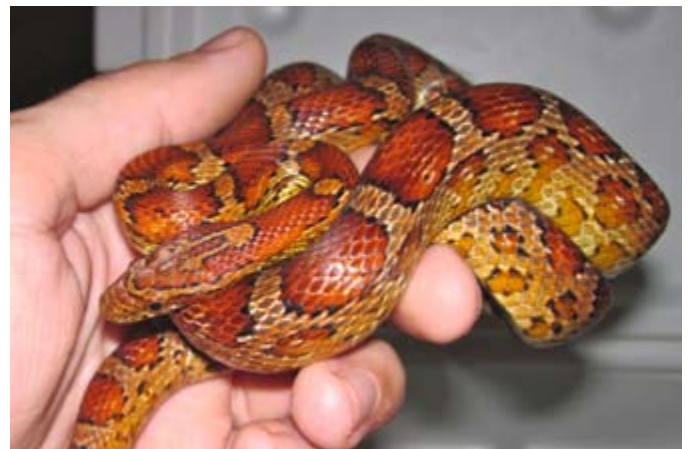
Fig. 2. Adult Red Cornsnake ( Pantherophis guttatus ) found alive on 2 December 2012 near Cherokee Sound, Abaco Island, The Bahamas (26.29015/-77.03432) (UF 169222).

consisting of Thatch Palm ( Thrinax radiata ), Mahogany ( Swietenia sp.), Poisonwood ( Metopium toxiferum ), and Gumbo Limbo ( Bursera simaruba ).