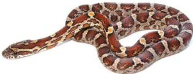
Fig. 1. Hatchling Red Cornsnake ( Pantherophis guttatus ) found alive on 25 October 2012 near Cherokee Sound, Abaco Island, The Bahamas (26.2835/-77.03469) (UF 169221).

I collected two Red Cornsnakes (Figs. 1 & 2) on Abaco Island, The Bahamas in October and December 2012 near the town of Cherokee on the eastern coast of Abaco. No available data point to the origin(s) of these snakes. The identification was confirmed by Dr. Kenneth L. Krysko, Florida Museum of Natural History. Collection sites were within 1 km of one another. Both snakes were found in a low-density residential area dominated by low, evergreen forest (coppice)